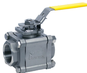
THREE PIECE - FLOATING - BALL