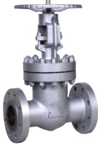
CAST STEEL - GATE VALVE