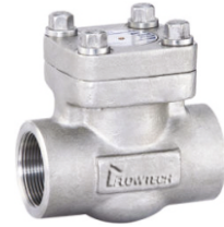
FORGED STEEL - CHECK VALVE