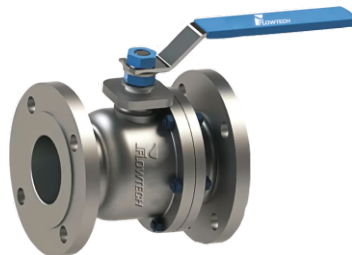
TWO PIECE - FLOATING - BALL