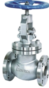
CAST STEEL - GLOBE VALVE