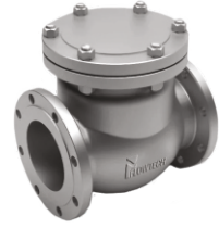
CAST STEEL - CHECK VALVE