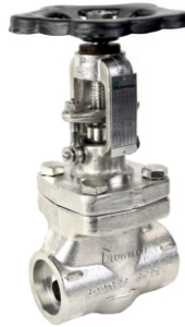
FORGED STEEL - GLOBE VALVE