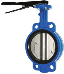
BUTTERFLY- WAFER (SEMI-LUG)