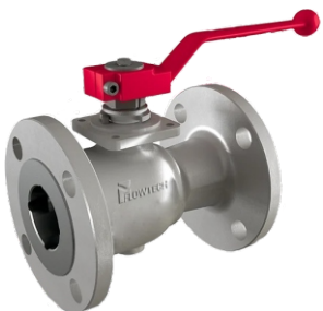
SINGLE PIECE - FLOATING - BALL