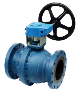
TRUNNION - BALL VALVE